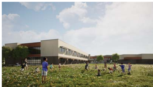
New Elementary School Courtyard