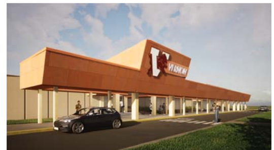
High School Entrance