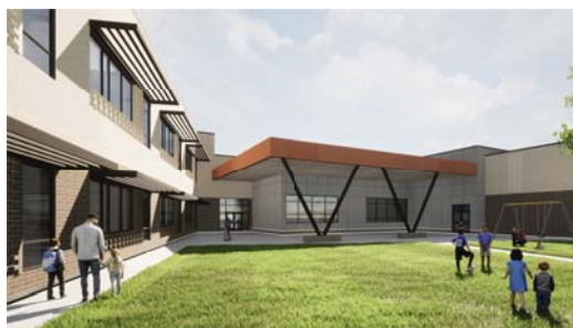
New Elementary School Courtyard