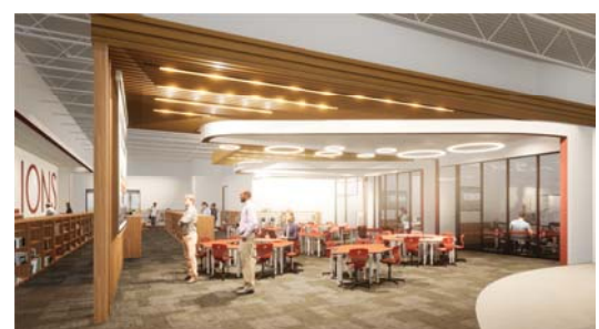
High School Media Center

FIND MORE INFORMATION AT VERNONISDBOND.COM