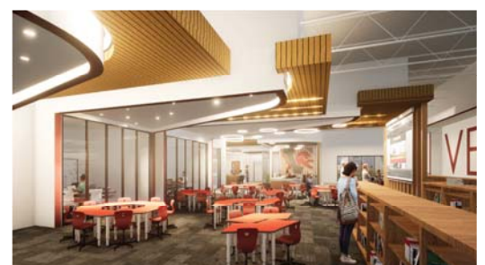
High School Media Center