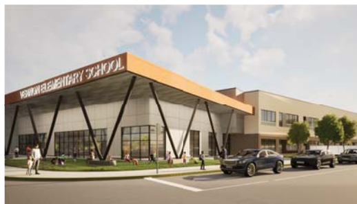
New Elementary School Entrance